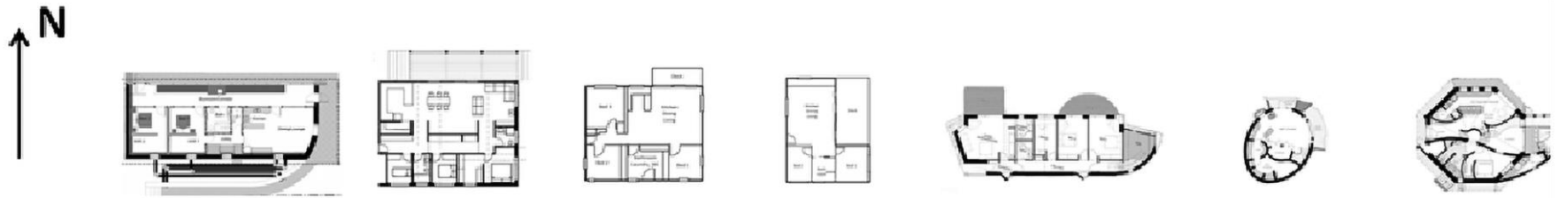
Figure 2 - Thumbnail sketches of relative plan sizes, shapes and orientations of the 7 innovative homes, numbered 1 to 7 from left to right