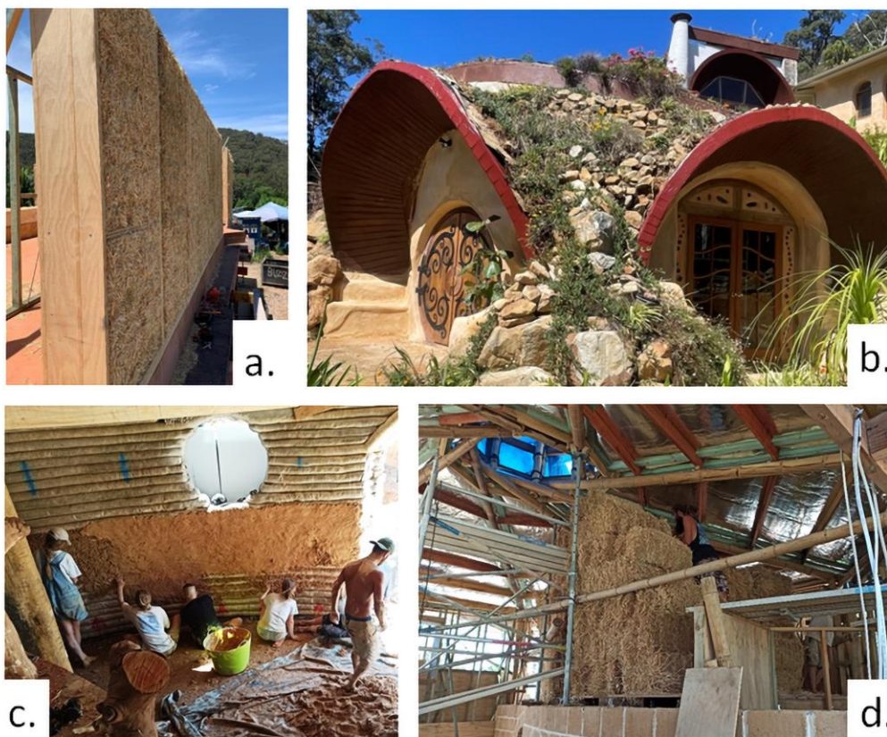
Figure 4 - Building technologies of homes 5 to 7. a. Prefabricated straw panel external wall for home 5; b. Home 6 art studio; c. Home 6 art studio internal wall clay rendering onto super-adobe earth bags; d. Straw baling the internal walls of the octagonal-shaped home 7, with the bamboo reciprocal roof at the top left blue cupola

Figure 4 shows the construction technologies of homes 5 to 7. It shows the prefabricated straw panels; the art studio rock walls and arched doors; the art studio internal wall clay rendering of the super-adobe walls; installing the internal straw bale walls of the octagon home.