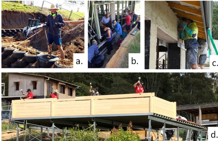
Figure 3 - Building technologies of homes 1 to 4. a. Compacting earth in tyres -earthship home 1; b. Home 2 volunteer hempcrete wall workshop; c. Home 3 hemp walls by builders; d. Home 4 builders hammering together the solid timber wall

Figure 4 shows the construction technologies of homes 5 to 7. It shows the prefabricated straw panels; the art studio rock walls and arched doors; the art studio internal wall clay rendering of the super-adobe walls; installing the internal straw bale walls of the octagon home.