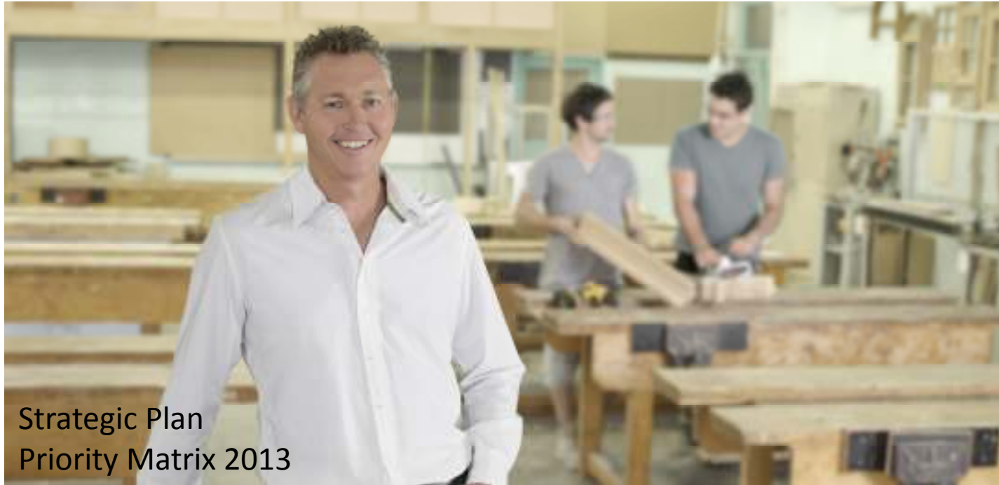
Strategic Plan Priority Matrix 2013